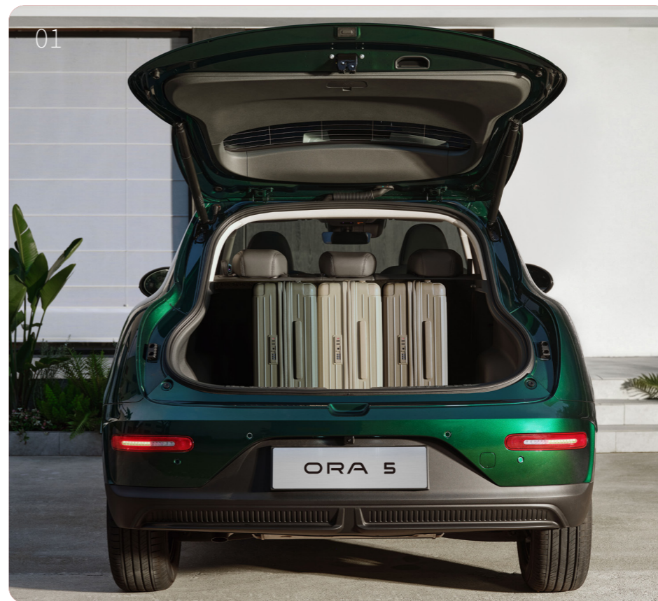
01 Hands-Free Electric Tailgate