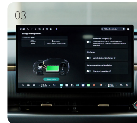
03 14.6-Inch Touchscreen